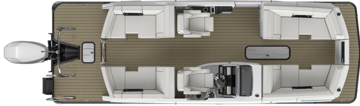
Horizon 24 C

Sit back, relax, and enjoy the "C" Layout's dual-facing bench seats. This design boasts two captain's chairs positioned for unobstructed viewing of the journey ahead. Deck space is optimized for easy movement and quick access to every point in the vessel. A custom stainless-steel gate encloses the aft area, keeping the smallest passengers and pets contained.