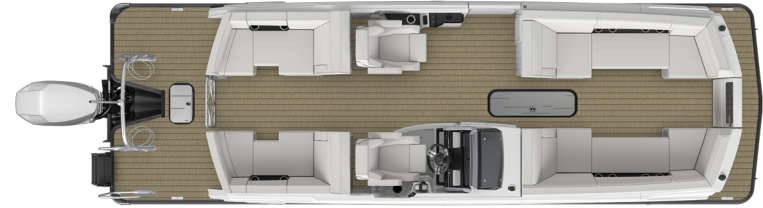
Horizon 26 C